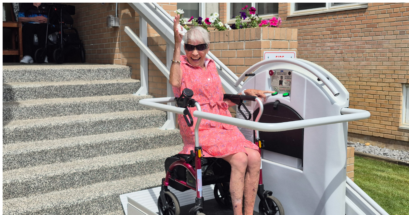
A happy resident at St. Joseph's Home in Medicine Hat during the launch of their donor-funded wheelchair lift.

We need your continued support for 2025-26 projects including: